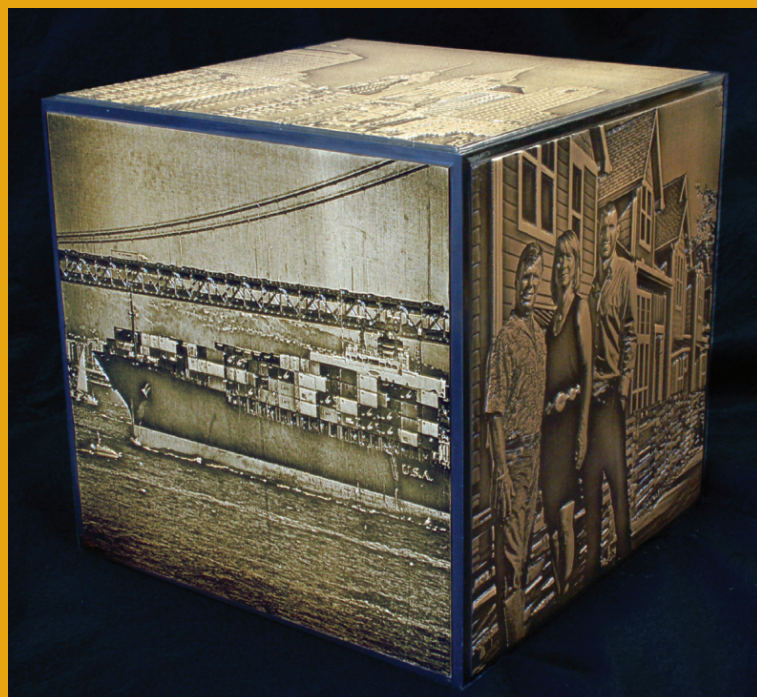
The Cube Photocast images on 2' bronze cube