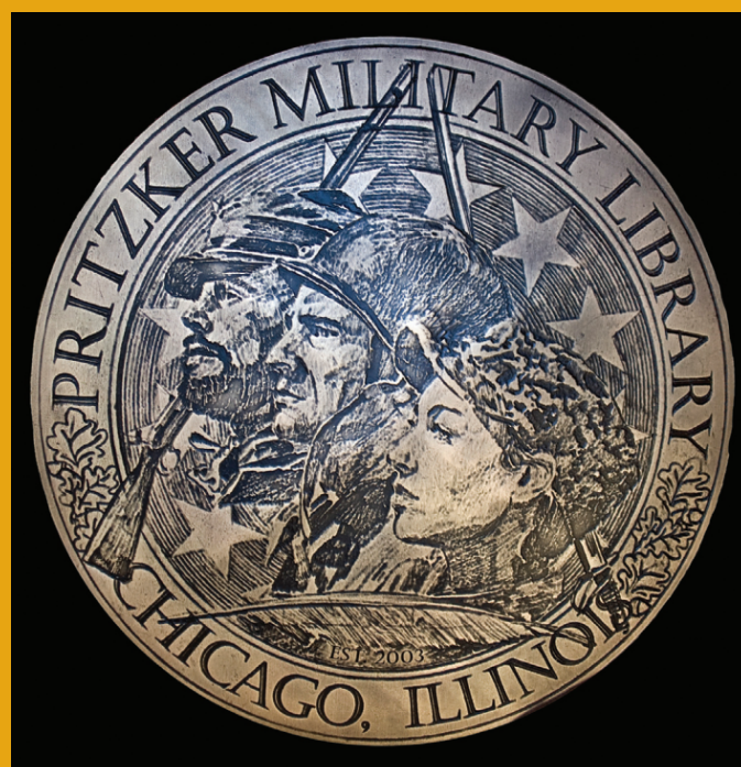
Military 42" Bronze Photocast plaque